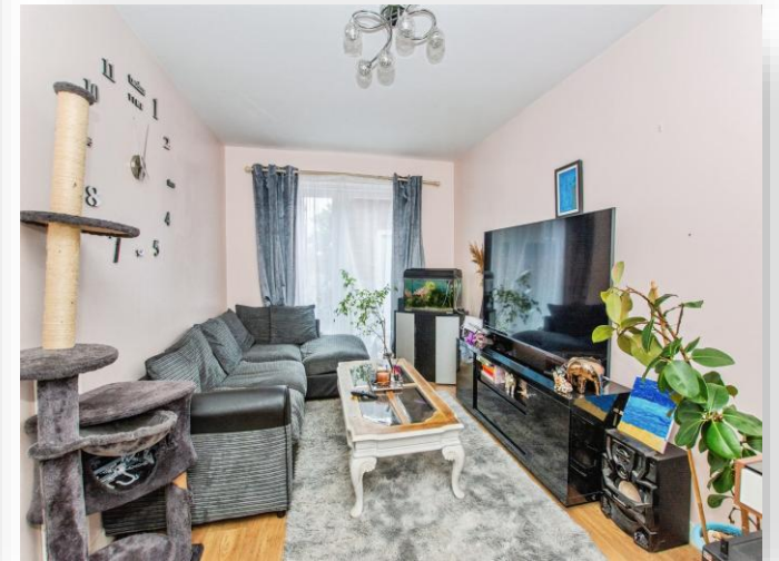
Ogden Gardens, Wisbech, PE13 3FE