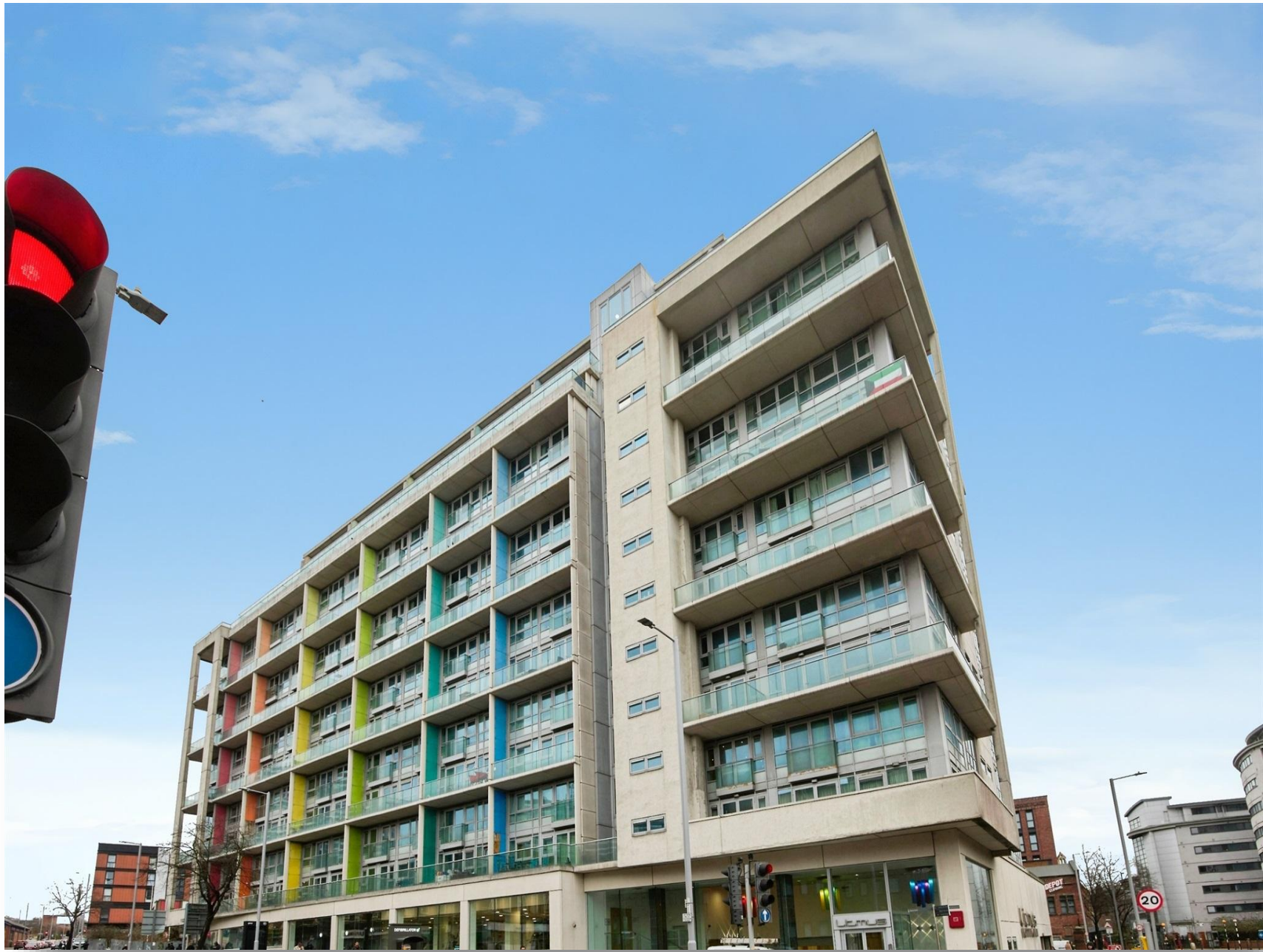
The Litmus Building Huntingdon Street, Nottingham NG1 3NX