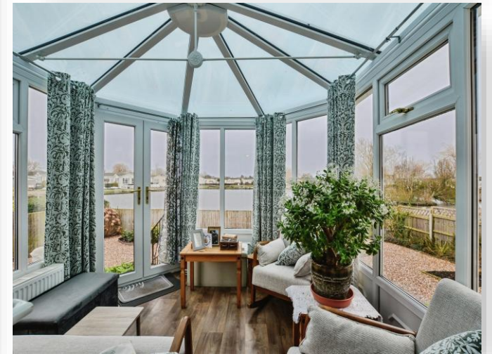
Kingfisher Drive Beacon Park Home Village, Skegness PE25 1TQ