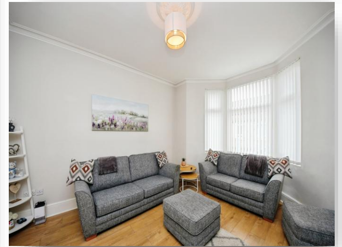
Princess Road, WALLASEY, CH45 5EP