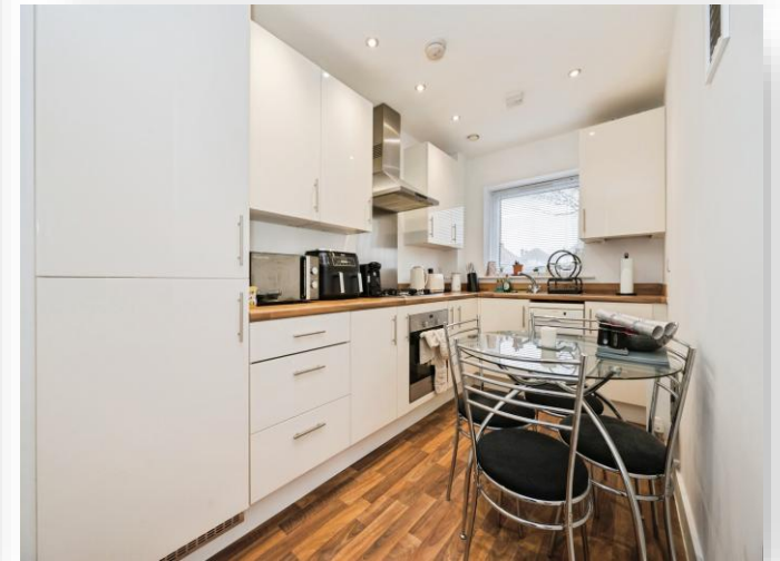
Laxton Close, Southampton SO19 9JA