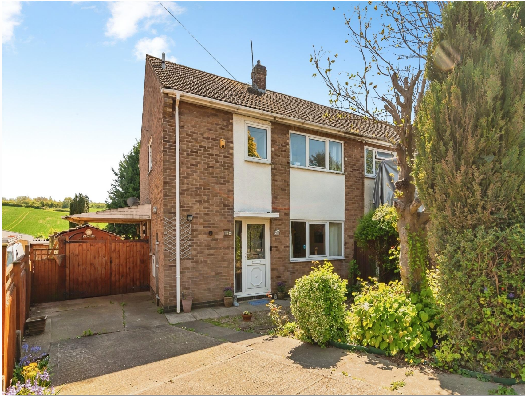
Cromwell Crescent, Lambley Nottingham NG4 4PJ