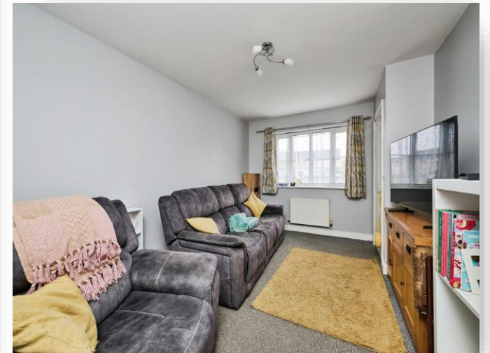
Copperfields, Wisbech, PE13 2HJ