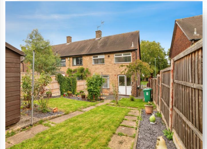
Glapton Lane, Nottingham NG11 8DE