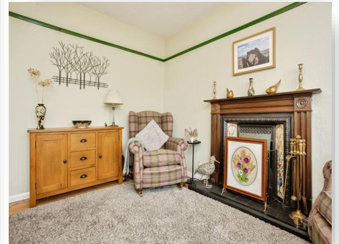
Stanstead Avenue, Tollerton Nottingham NG12 4EA