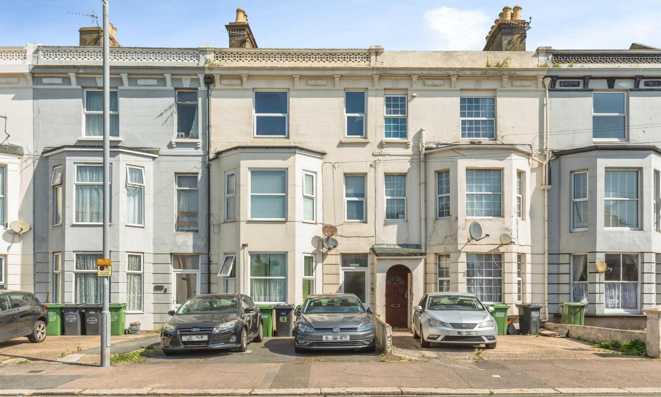
Mount Pleasant Road, Hastings TN34 3SJ