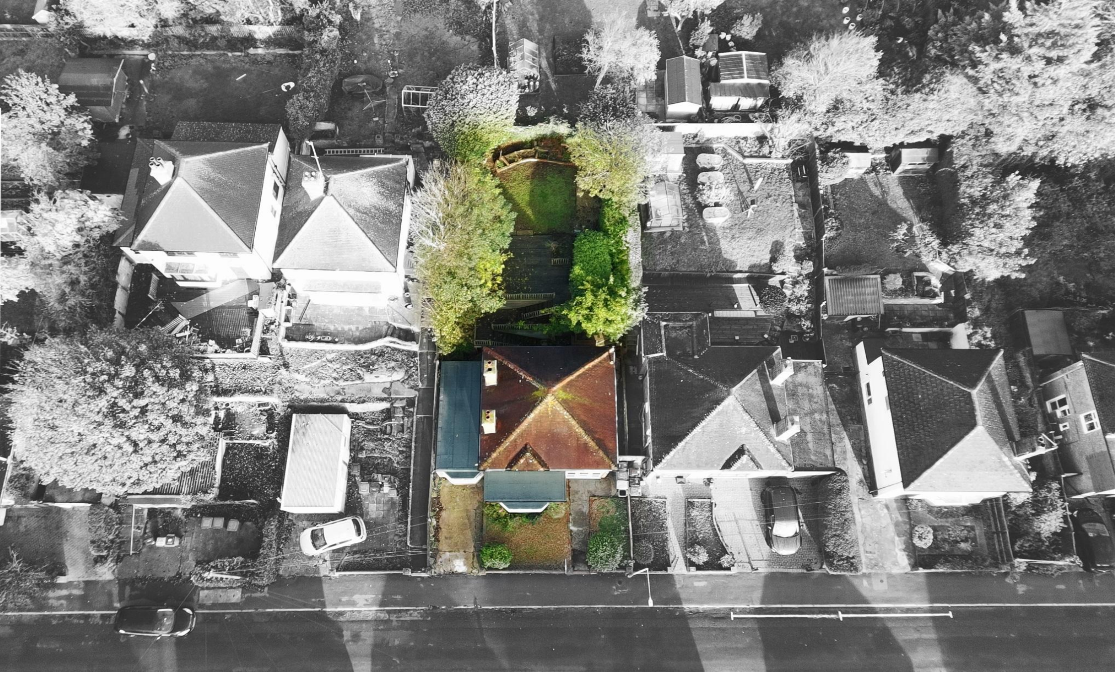
Vale Road, Seaford, BN25 3EZ