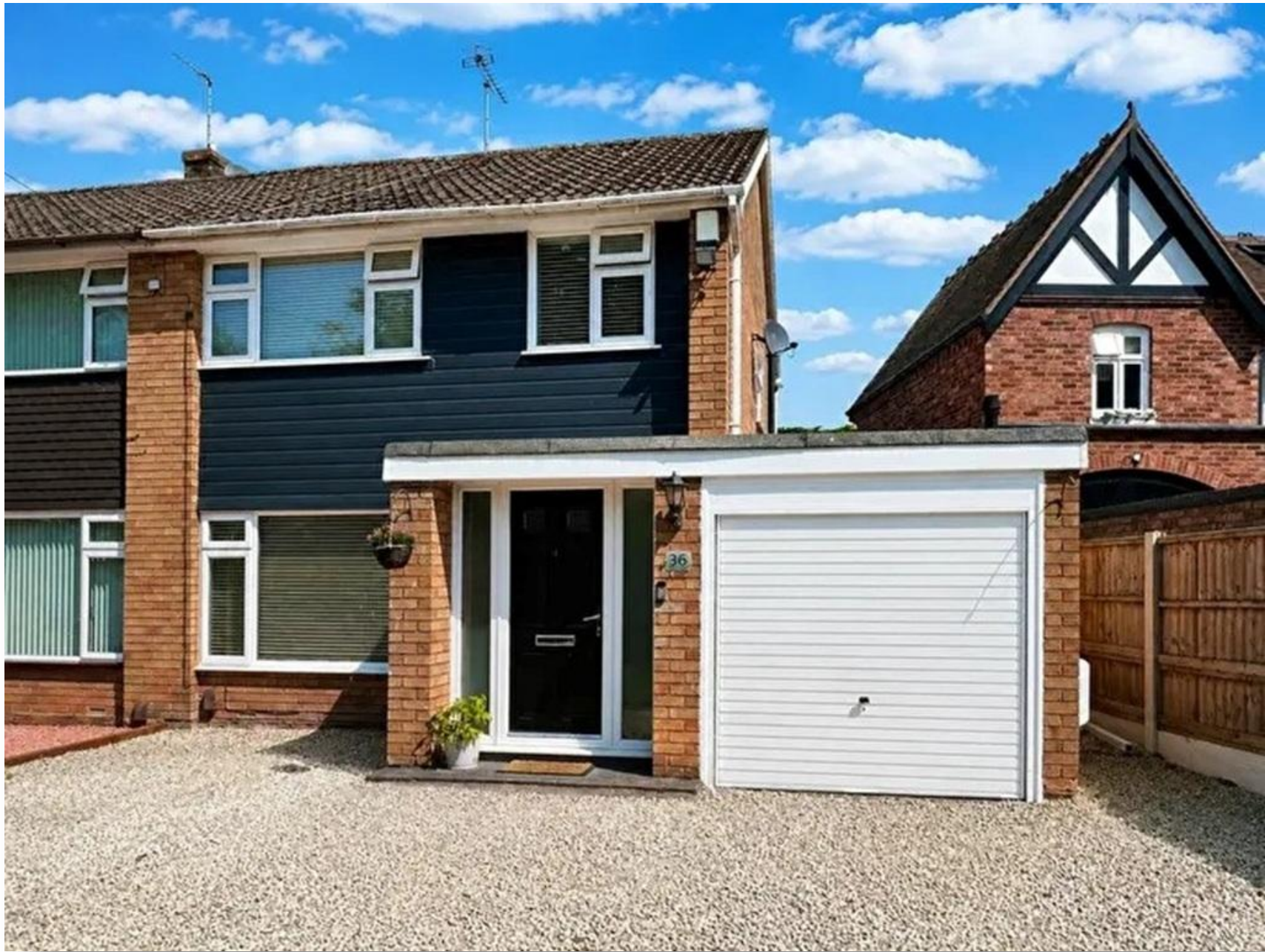
Station Road, Hagley Stourbridge DY9 0NU