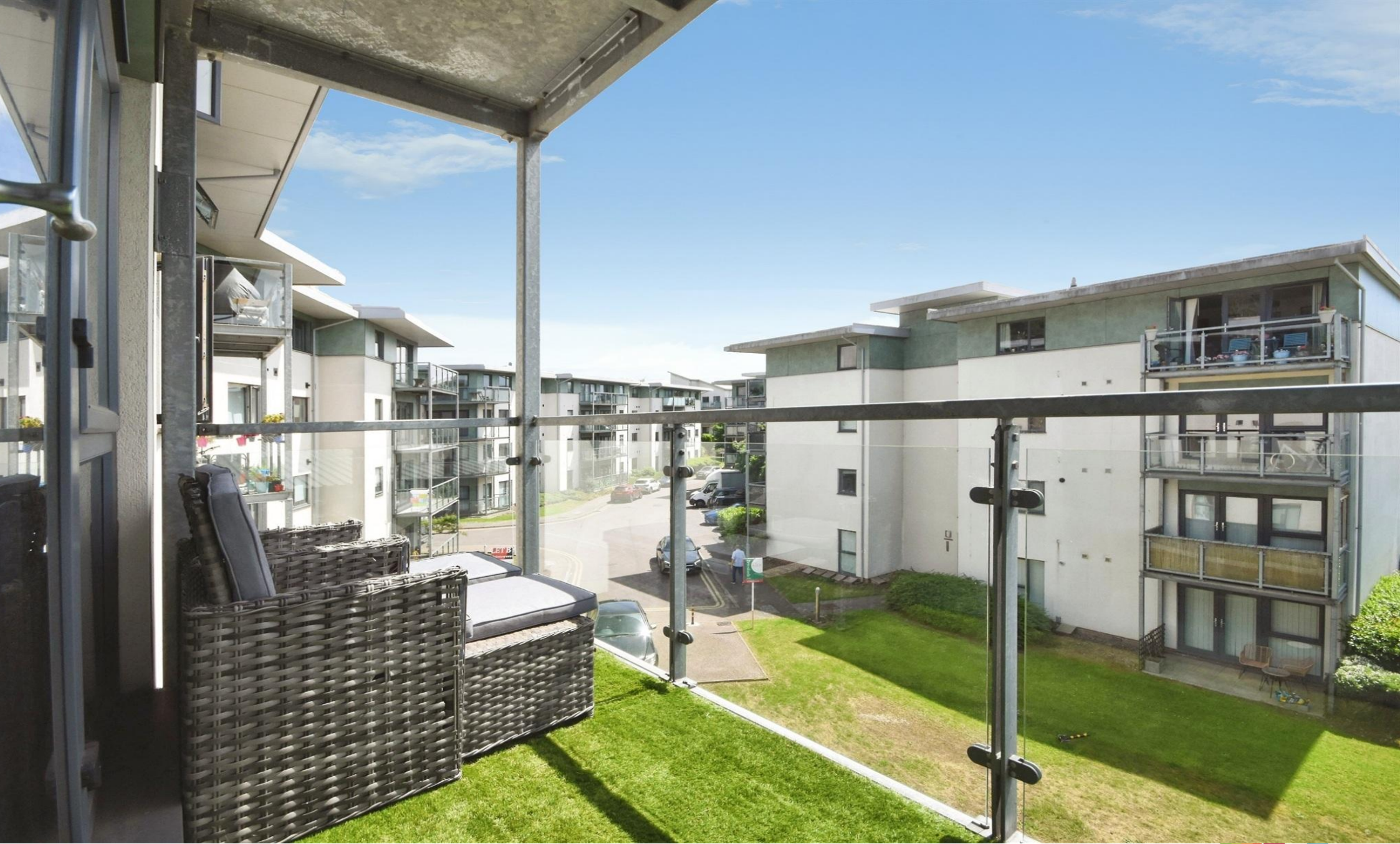
Wilkinson Court, Rollason Way, Brentwood, CM14 4EU