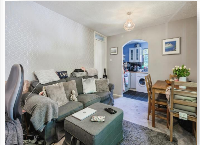
St. Marys Court, Plymouth PL7 4PE