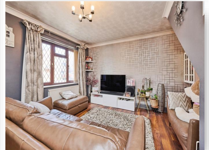
Hoylake Drive, Farcet Peterborough PE7 3BD