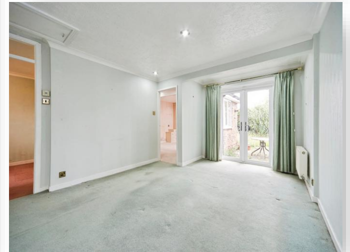
Haven Court, LEEDS LS16 6SH