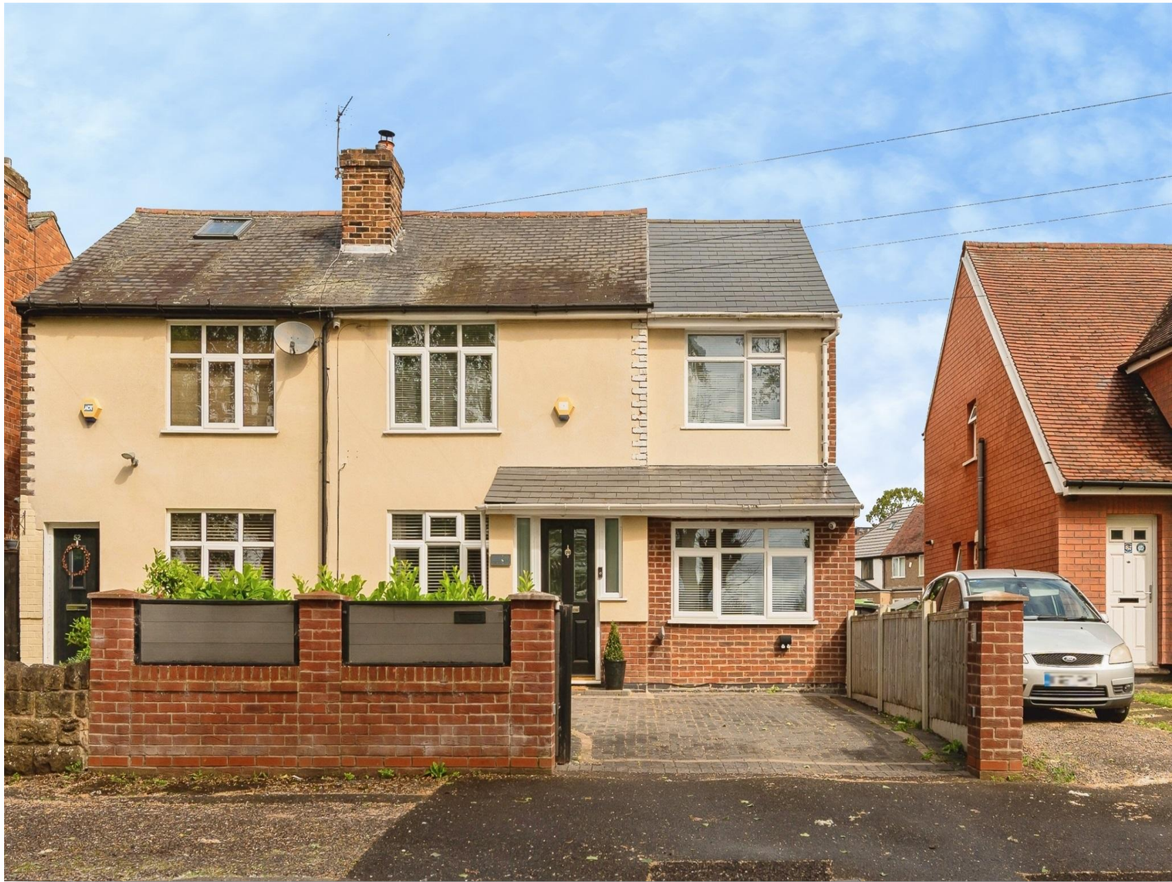
Chetwynd Road, Beeston Nottingham NG9 5GD