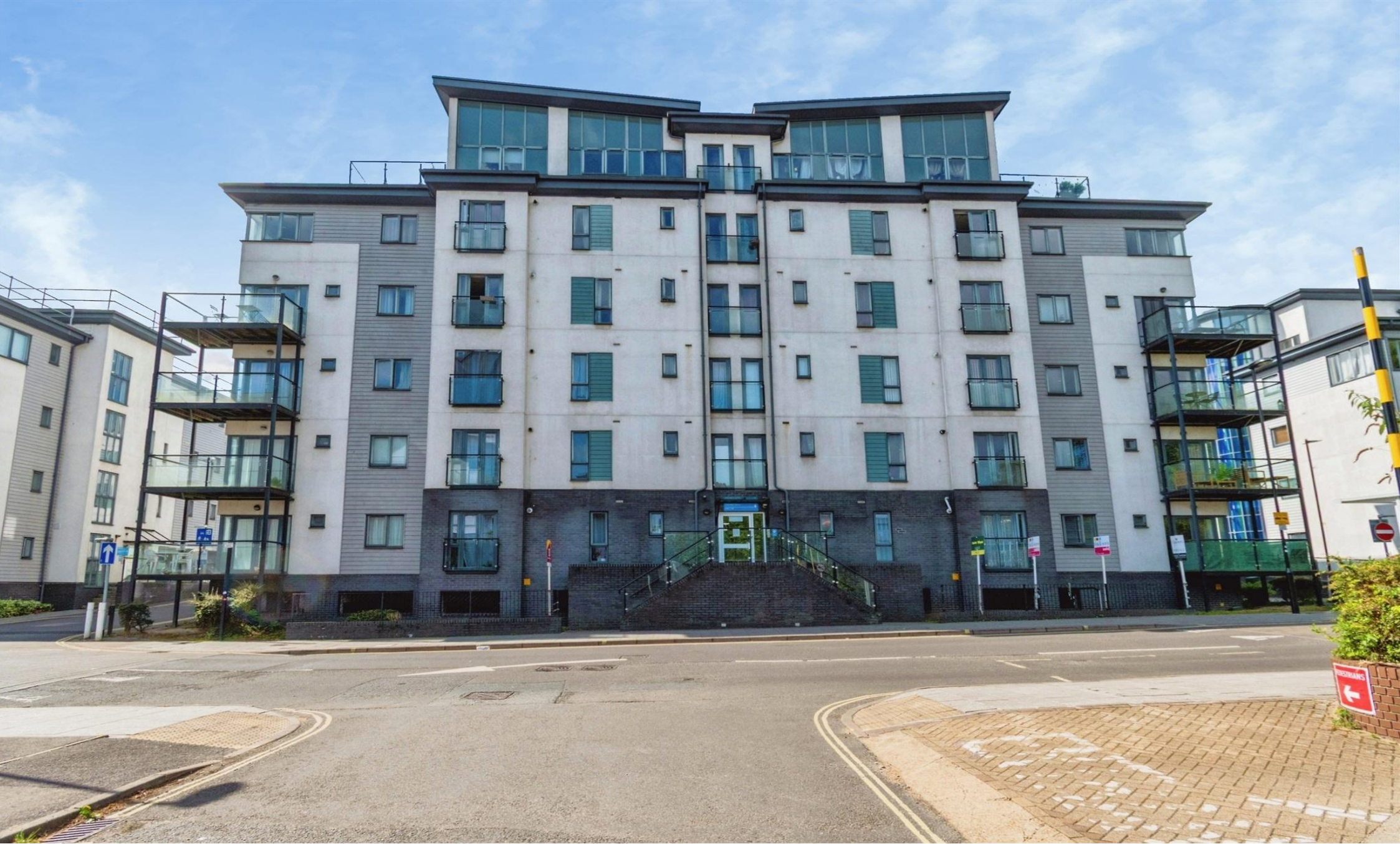
Columbus House, The Compass, Southampton SO14 5BQ