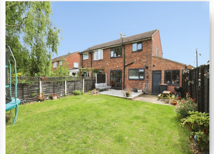
Olive Walk, Harrogate HG1 4RL