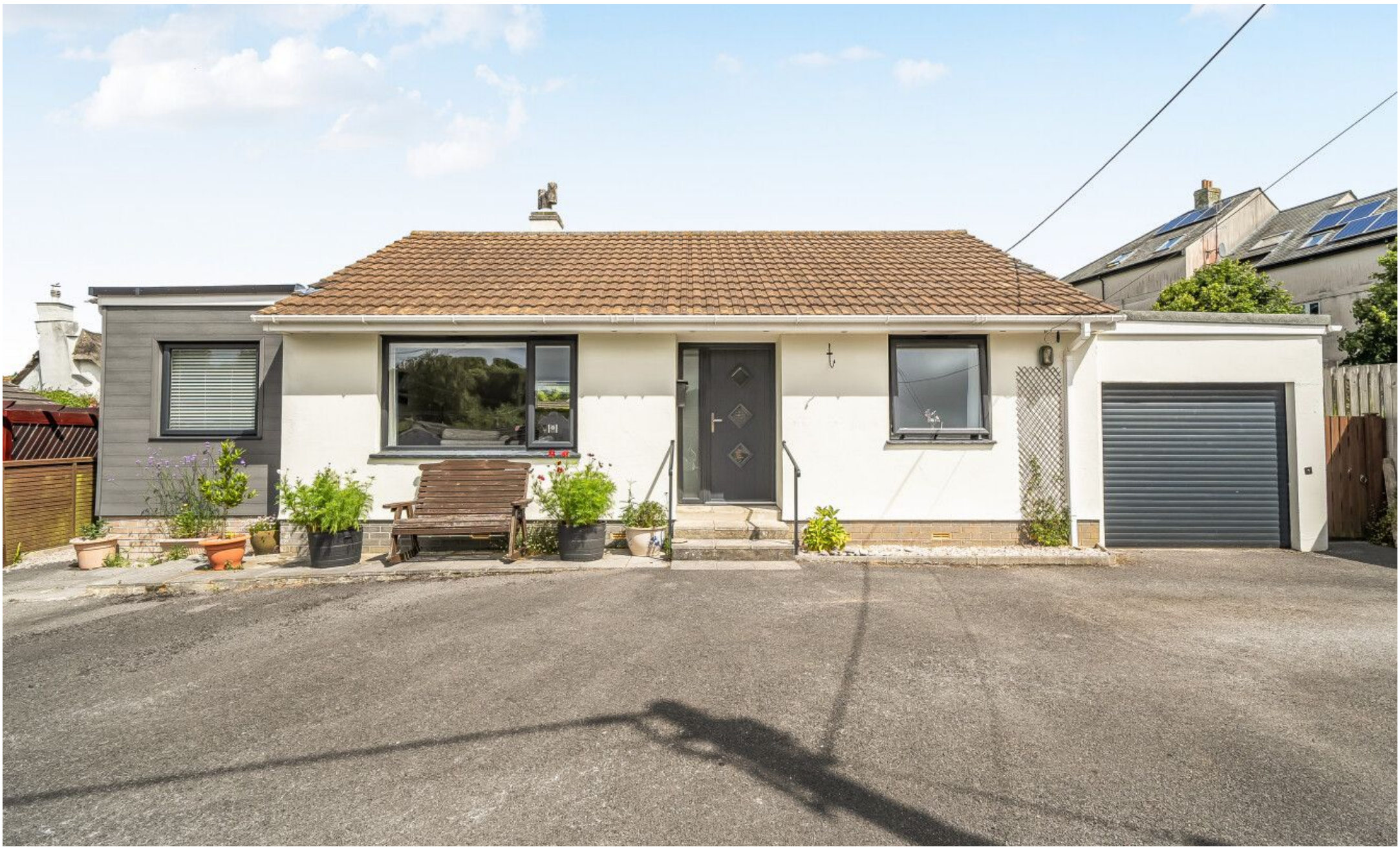
Ansteys, Tanpits Road Kingsbridge