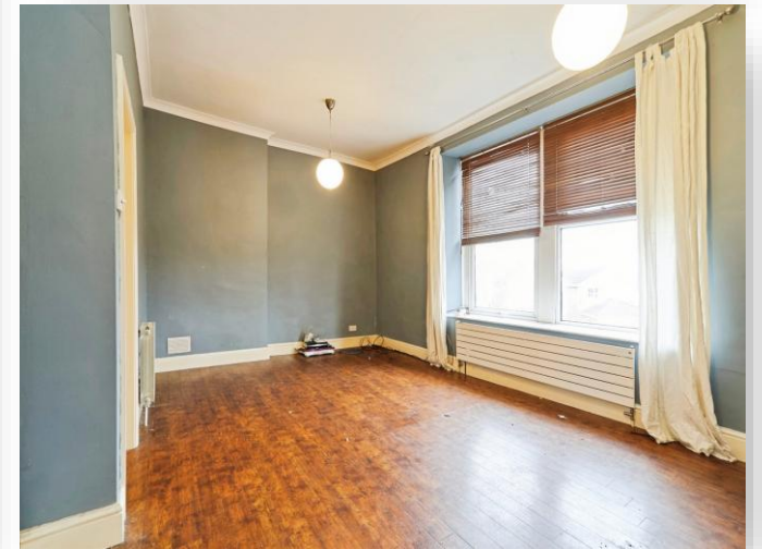
Newlathes Grange Newlathes Road, Horsforth Leeds LS18 4LG