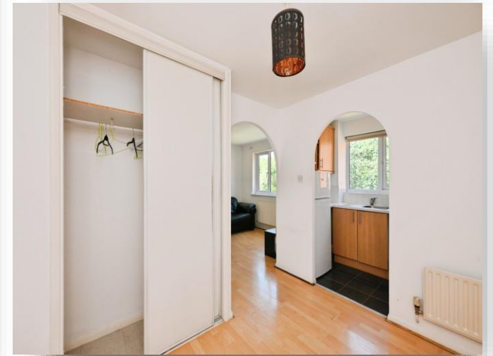
Parrotts Field, Hoddesdon EN11 0QU