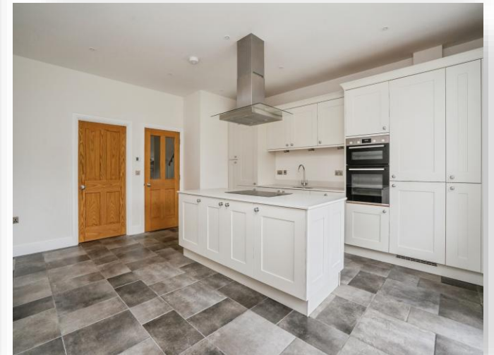
Crescent Road, Gosport, PO12 2DJ