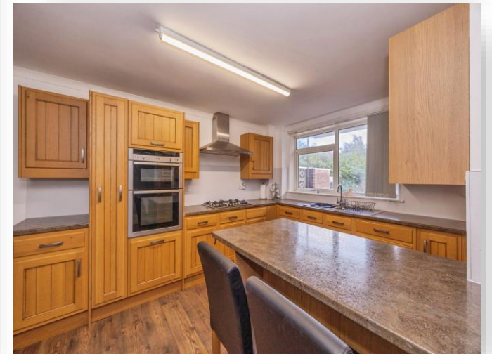
Apollo Drive, Waterlooville PO7 8AD