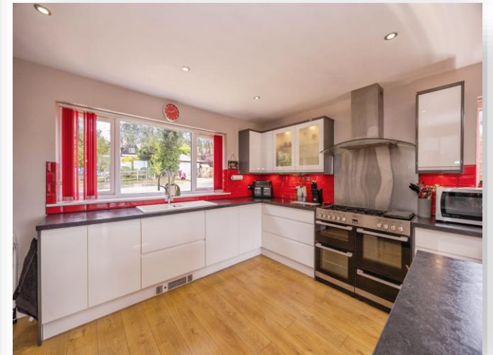
Yoells Lane, Waterlooville PO8 9SQ