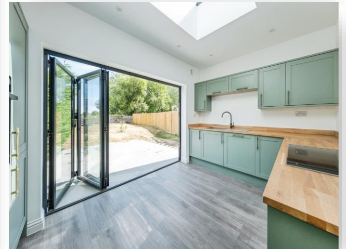
Queens Avenue, Newport Pagnell, MK16 8EU