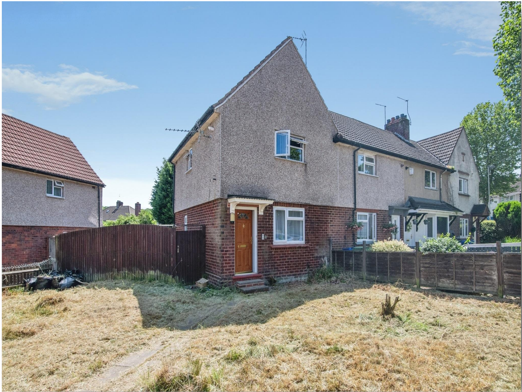
Beech Road, Dudley DY1 4BP