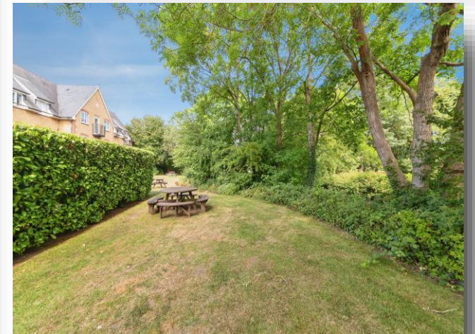
Sele Mill, North Road, Hertford, SG14 1LD