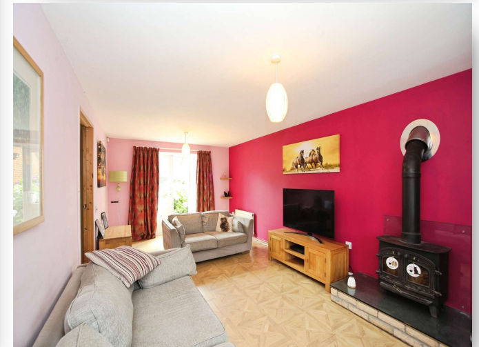
Clos Nanteos, Pontprennau Cardiff CF23 8XR