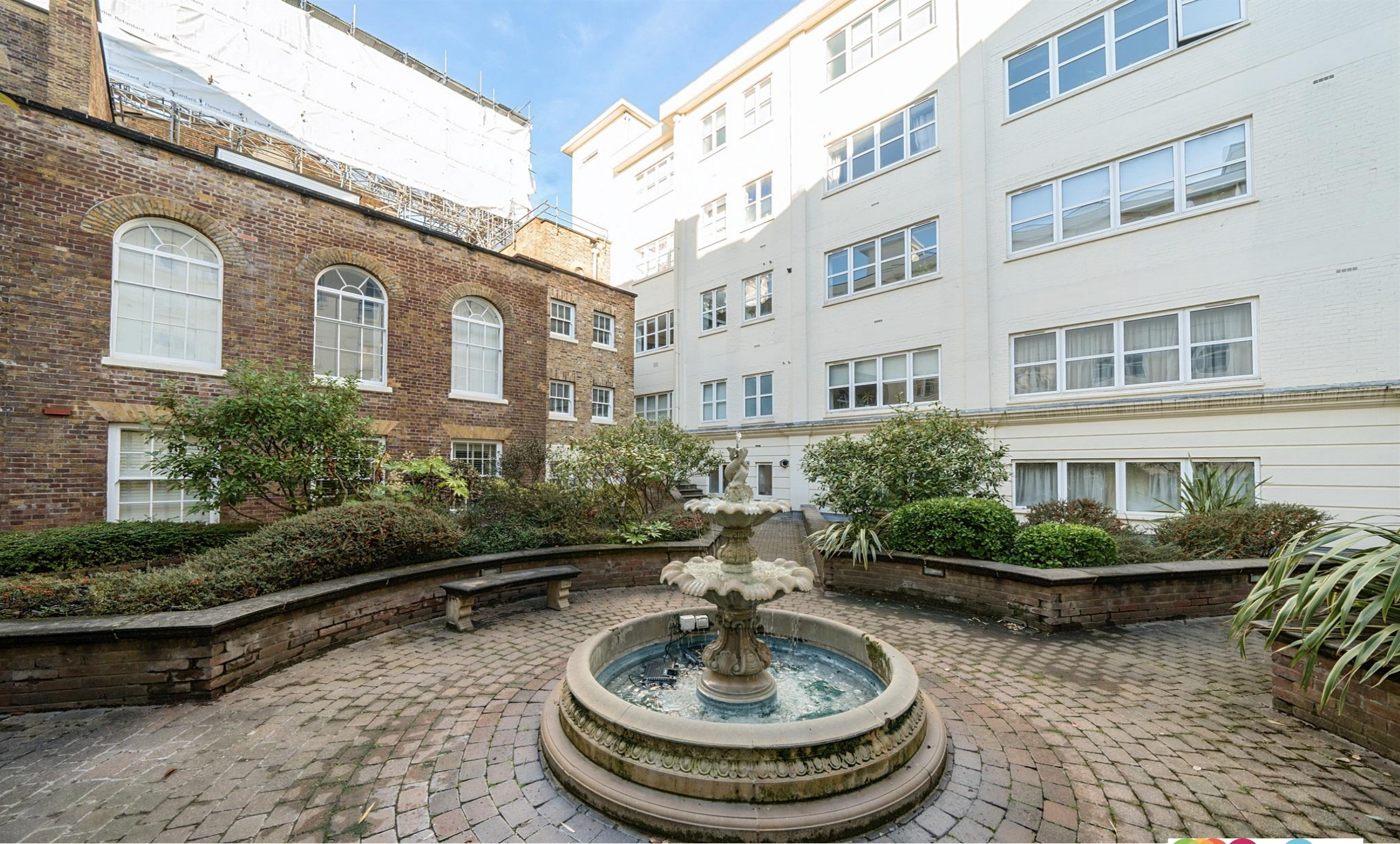
Imperial Court Kennington Lane, London SE11