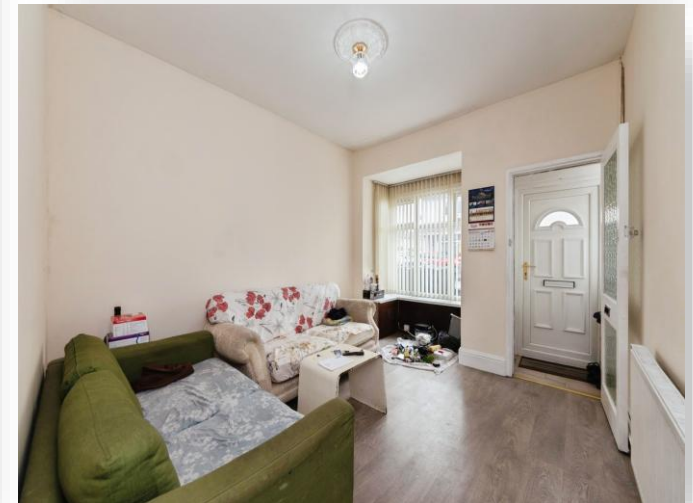
Formans Road, Sparkhill Birmingham B11 3AX