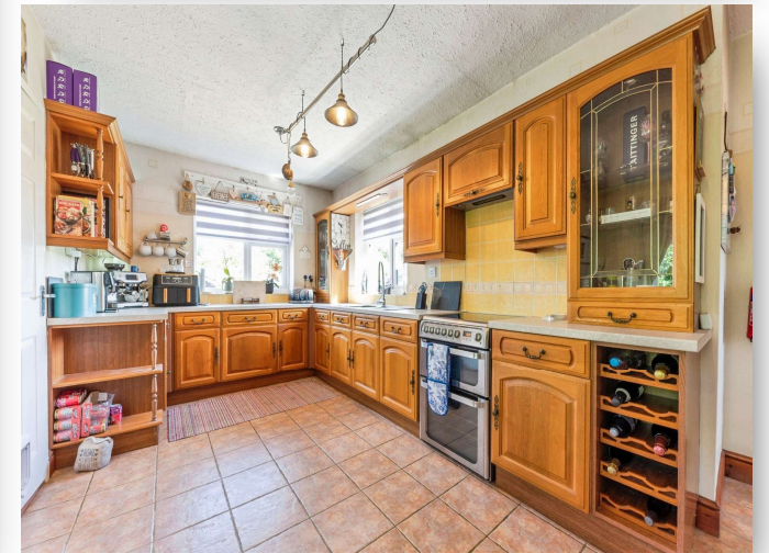
Bulpit Lane, Swinderby Lincoln LN6 9LT