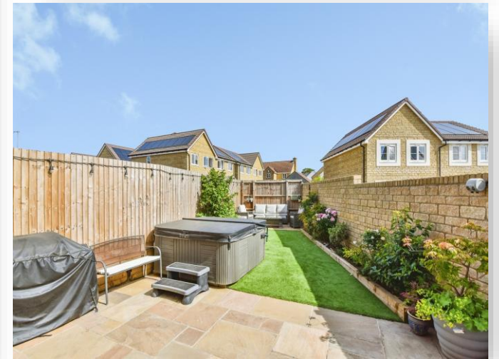
Brimstone Road, Frome, BA11 5GA