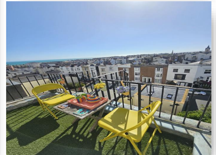
Brunswick Place, Hove BN3 1ND