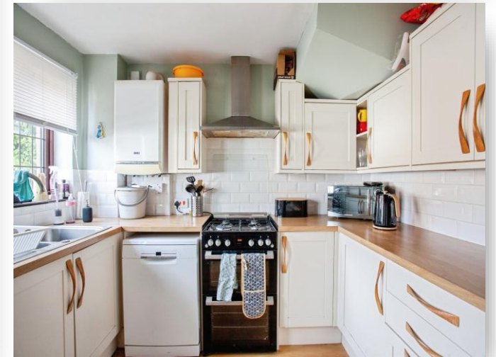
Church View Washfield Lane, Treeton Rotherham S60 5PU