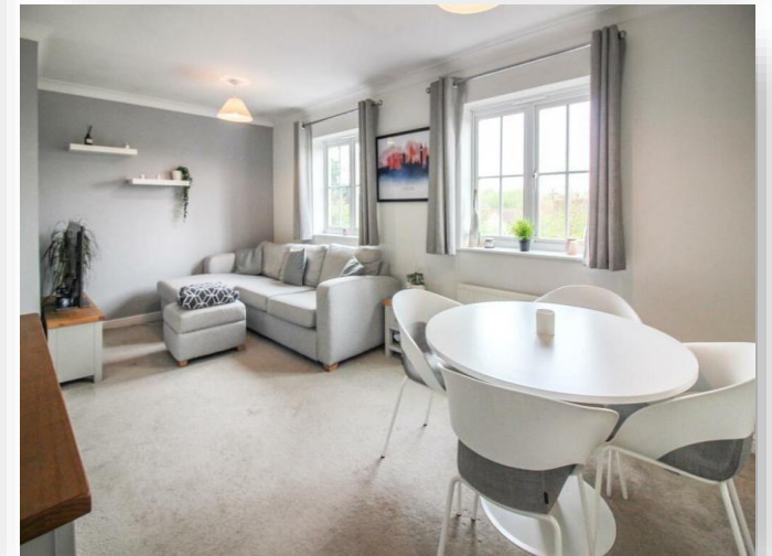
Paddock Close, Aylesbury HP19 7BJ