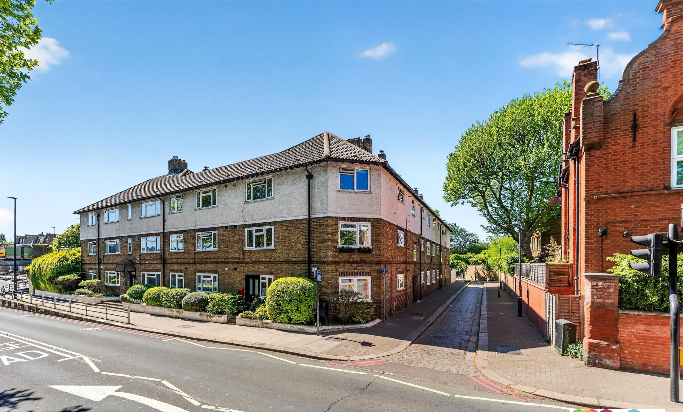
Stevenson House, Latchmere Road, London, SW11 2DU