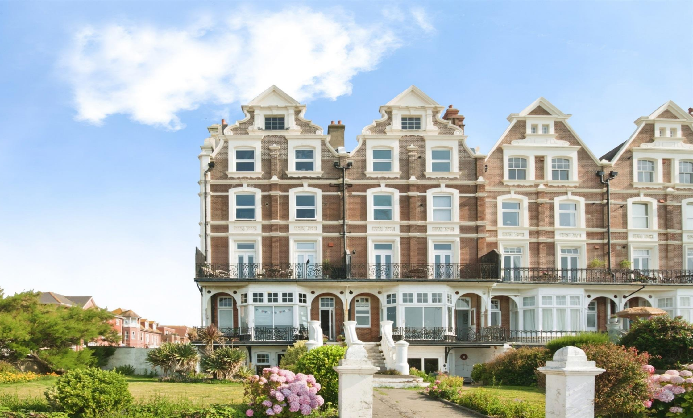
Hartley Court - Knole Road, Bexhill-On-Sea TN40 1LH