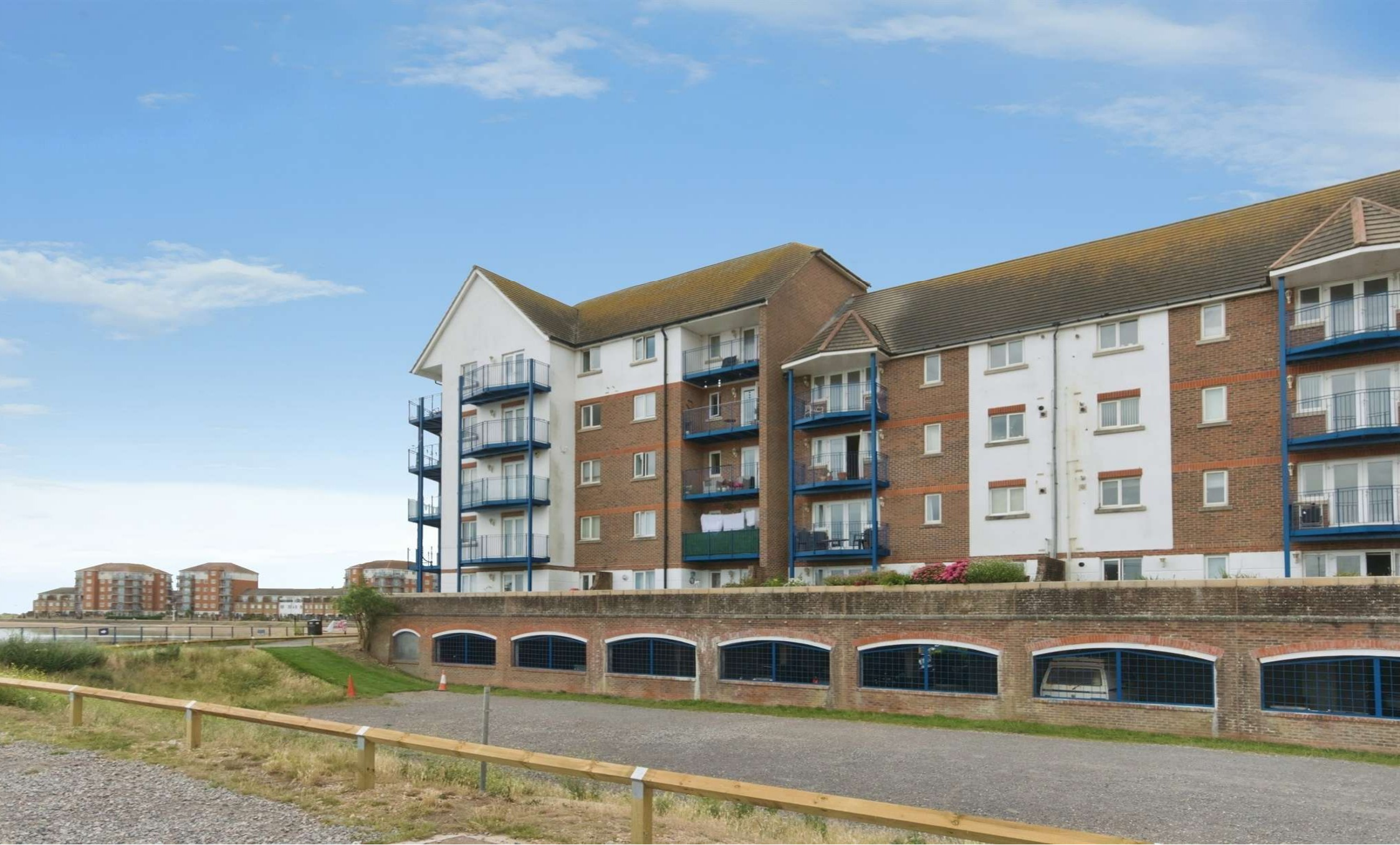
Bermuda Place, Eastbourne BN23 5TE