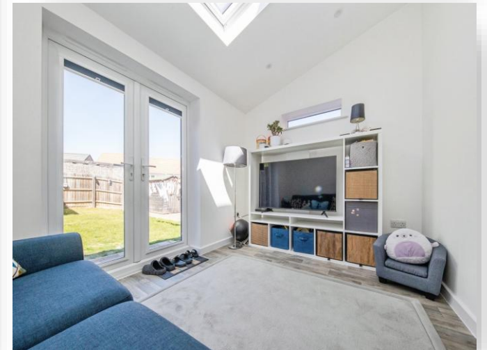
Meadow Drive, Great Blakenham, Ipswich, IP6 0NH