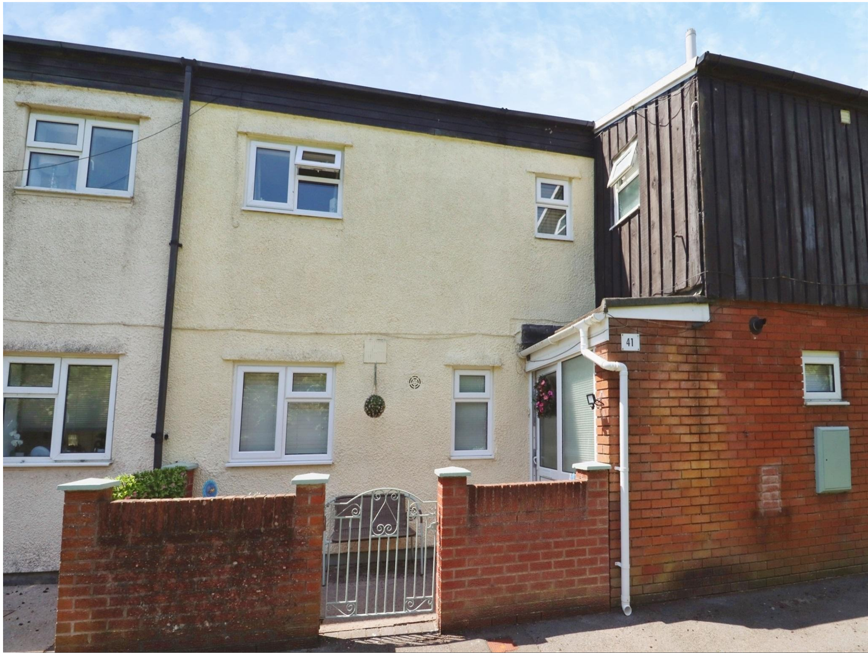
Livingstone Way, St. Athan Barry CF62 4JG