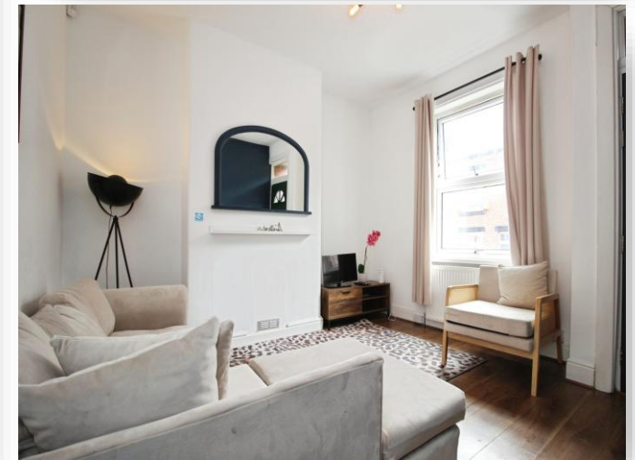
Burley Lodge Terrace, Leeds LS6 1QD