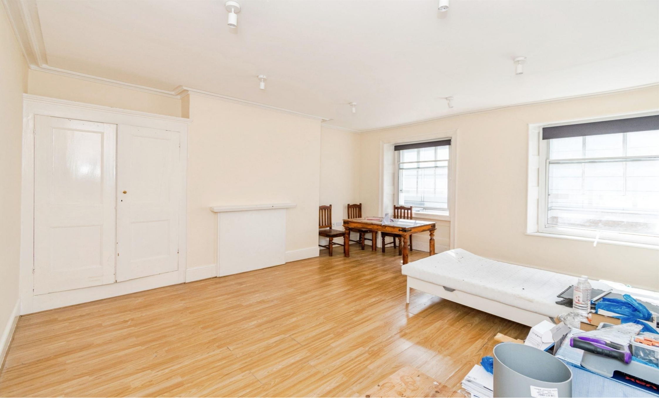
Portland Terrace, Southampton SO14 7EA