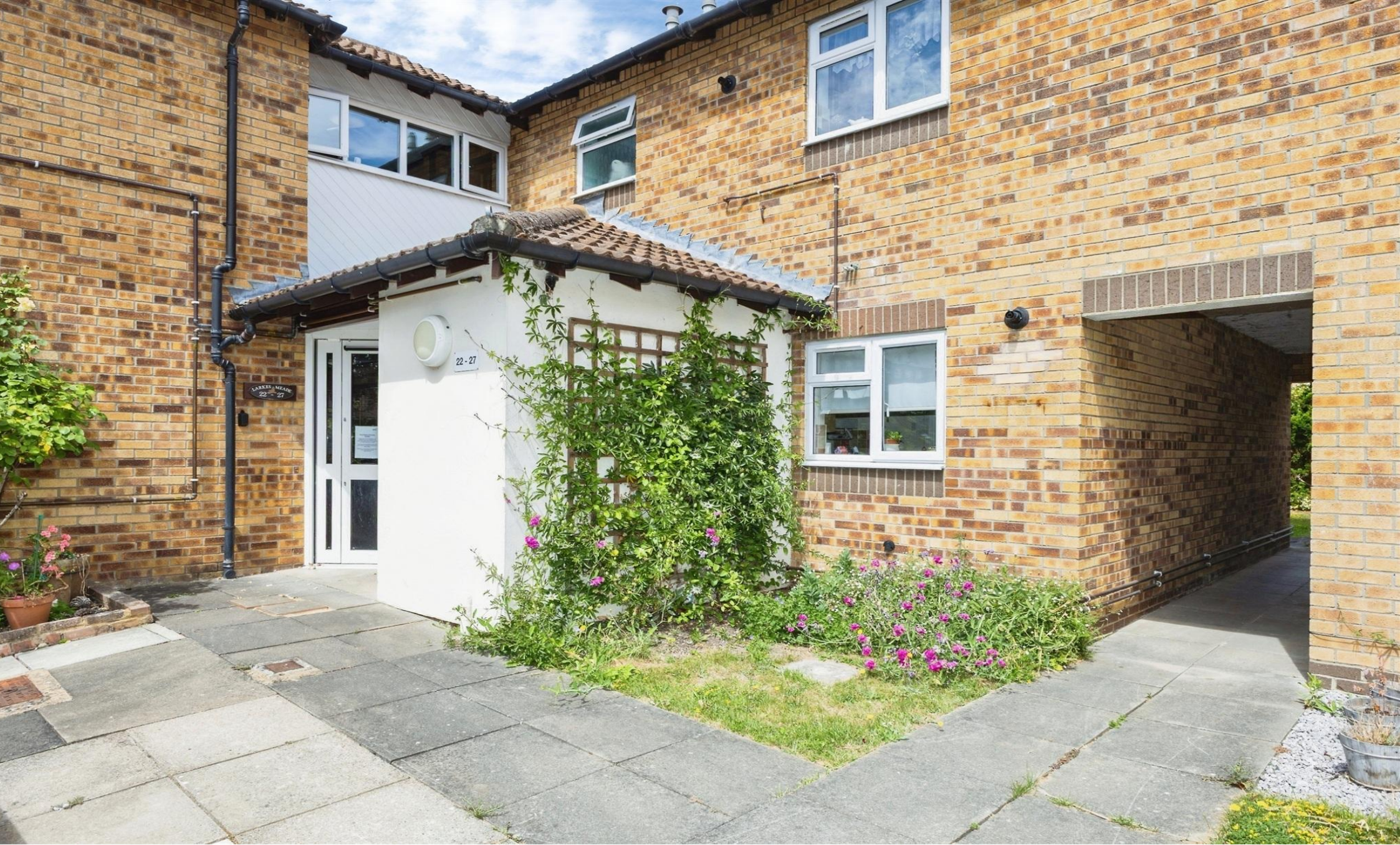
Larks Meade, Earley Reading RG6 5TA