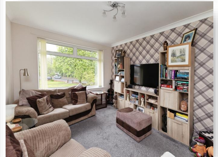
Crescent Lodge, The Crescent, Middlesbrough TS5 6SF