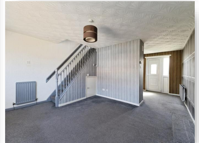
Roseberry Road, Middlesbrough TS4 2QF