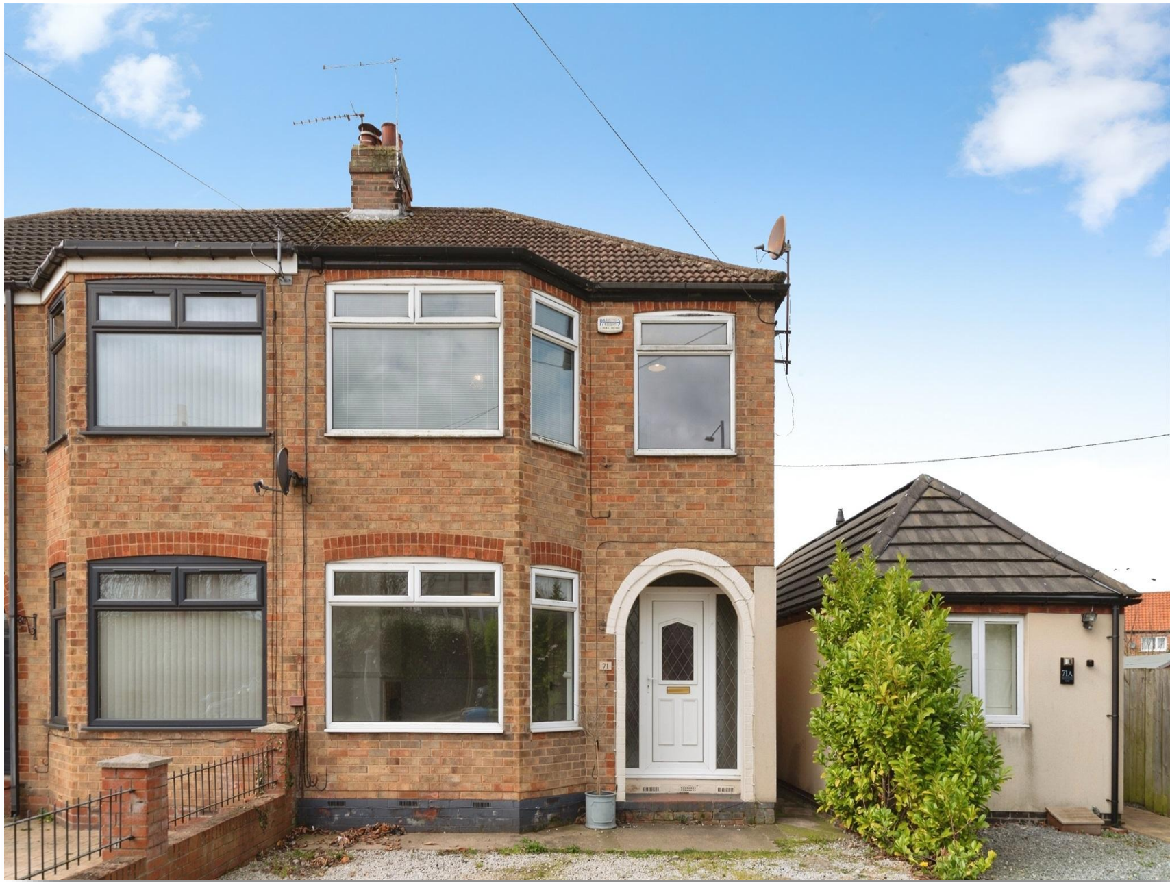
Swinemoor Lane, Beverley, HU17 0LY