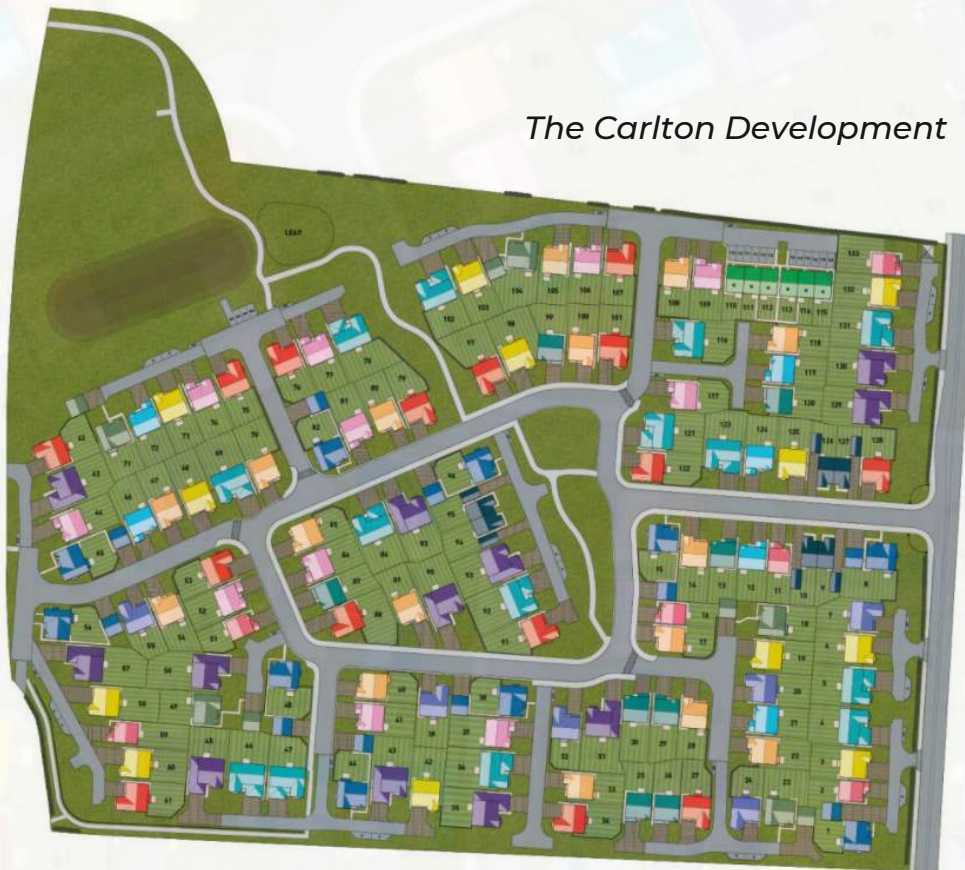
The Carlton Development

In nearby Carlton, a 133 home development has recently been completed comprising 3 and 4 bedroom luxury properties. Rawcliffe Meadows is an exclusive development with only nine 2-3 bedroom properties set in the semi-rural village of Rawcliffe. Camblesforth also has a desirable development underway at its Willow Drive site.