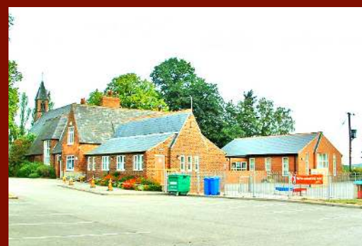
Cowick Primary School