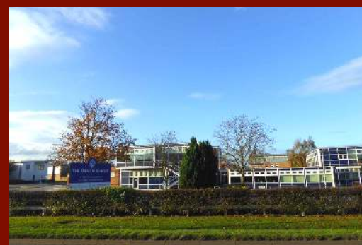
The Snaith School