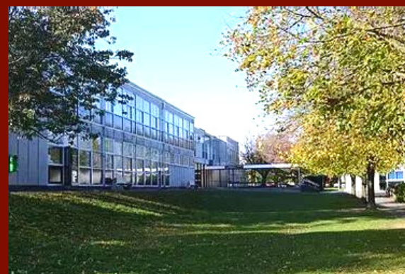
Sherburn High School

Sherburn High School De Lacy Academy - good Airedale Academy - good Brayton Academy - outstanding Selby High School - good