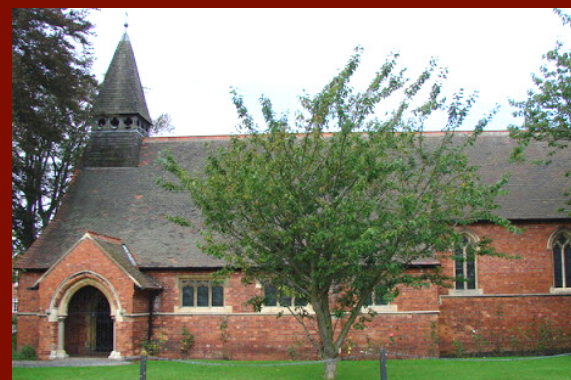
Hambleton Church of England Primary School

Tiny Toes Private Nursery, Hambleton Playcare Day Nursery, Brotherton - good Play Safe at the Pavilion, Hillam Selby District Peter Pan Nursery - good Olive Tree Day Nursery - good