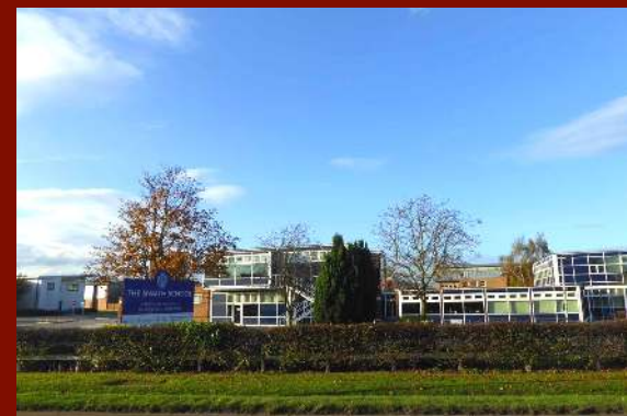
The Snaith School